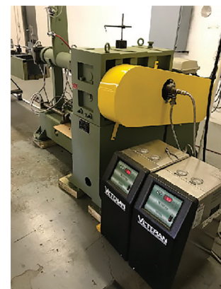
The machine line in our Middlefield, Ohio Facility.